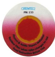
Filter Over Saturated