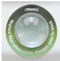
Filter is good