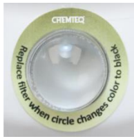
Filter is good