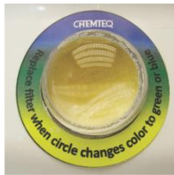
Filter is good