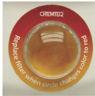
Filter is good